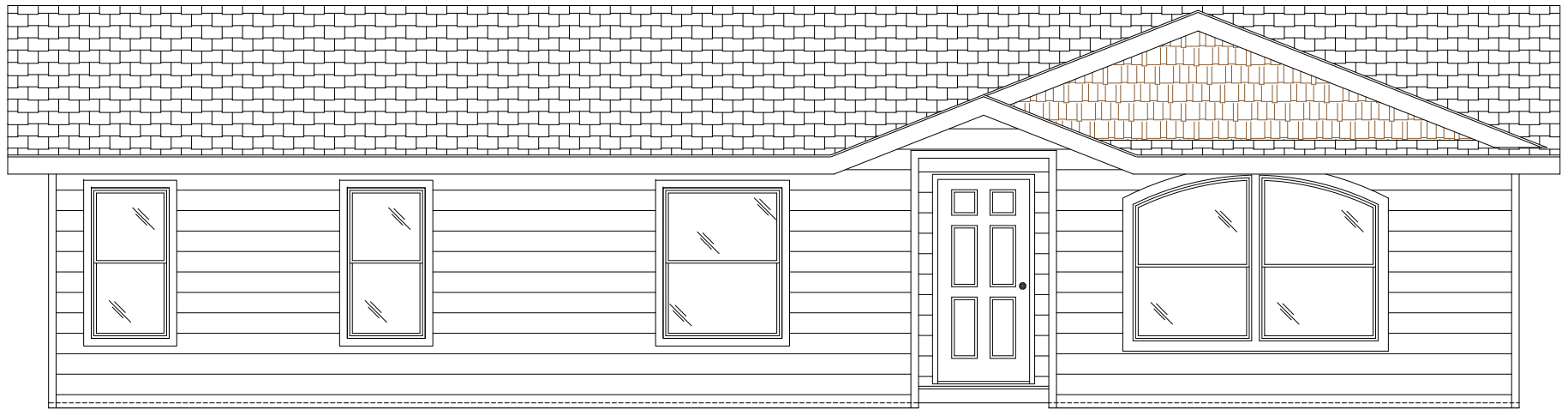
MAJESTIC "THE ASPEN" 9589-S FRONT EXTERIOR